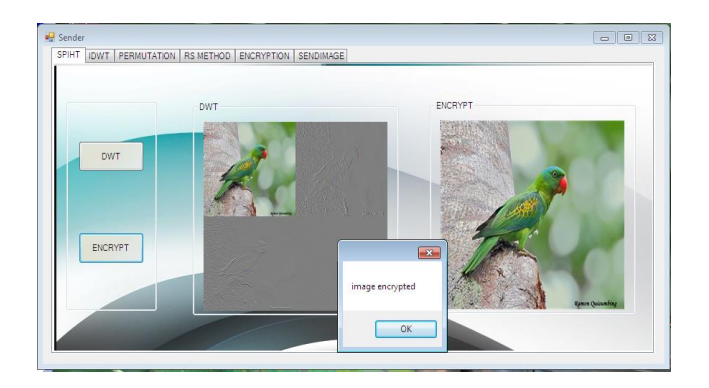
Figure 2 DWT of an Image

The Figure 2 shows the DWT of an image. The original image will be uploaded to encrypt. Then the image will be encrypted using DWT.