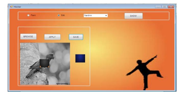
Figure 4 Hacked Image

The Figure 3 shows the Permutation of an image. It is an arrangement of image parts the original image will be change.