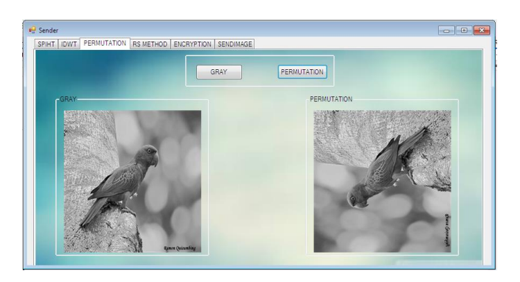
Figure 3 Permutation

The Figure 2 shows the DWT of an image. The original image will be uploaded to encrypt. Then the image will be encrypted using DWT.