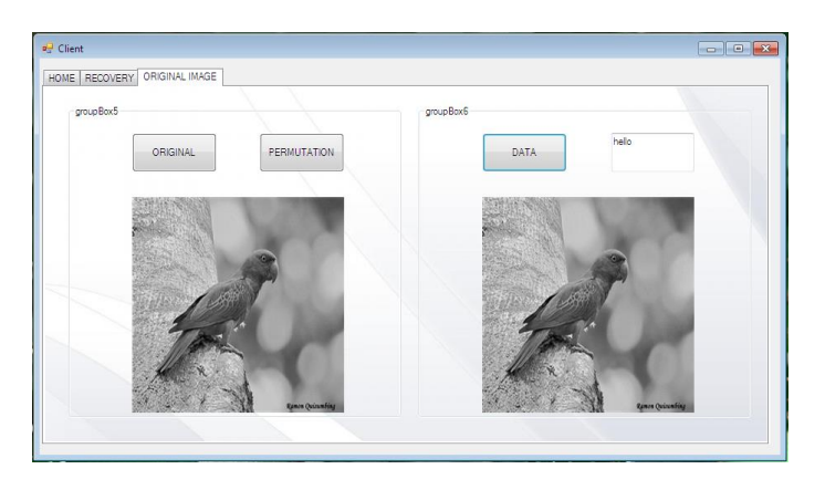
Figure 5 Retrieval Original Image

The figure 4 shows the hacked image. In hacking stage, the hackers make change in an original image.